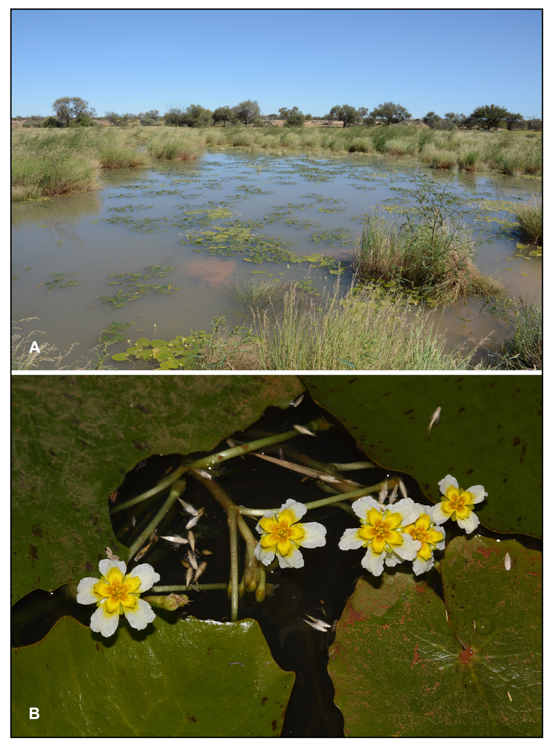
Figure 2. Nymphoides walshiae. A – habitat at Lyndon Station; B – flowers. Voucher: R. Davis, C. Walsh & S. D'Arcy RD 12547.