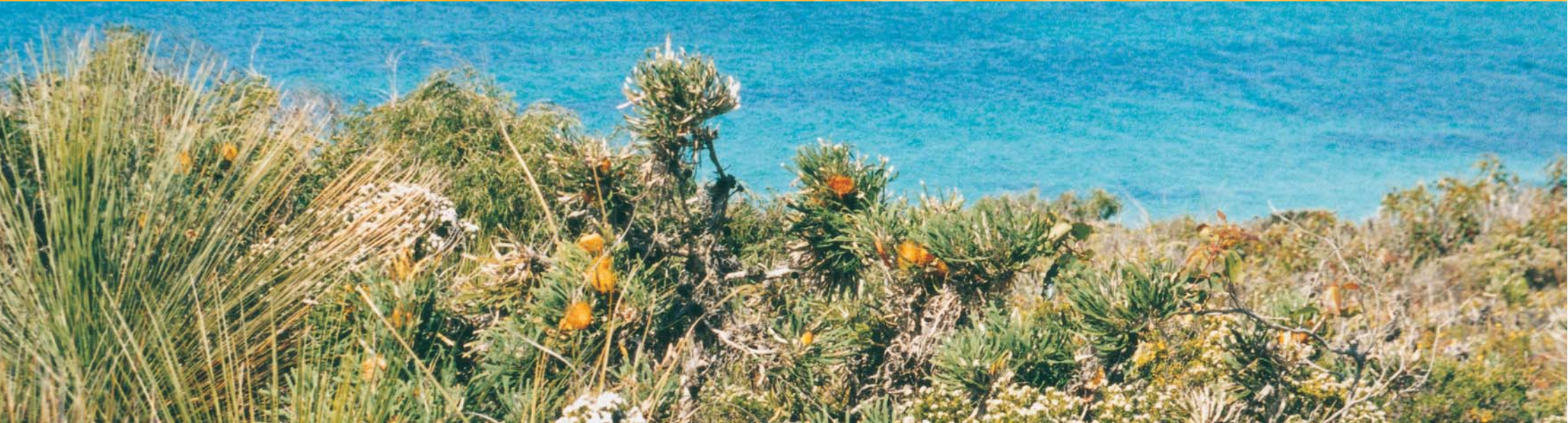
Sharp Point, Torndirrup National Park