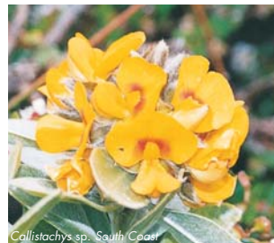
Callistachys sp. South Coast