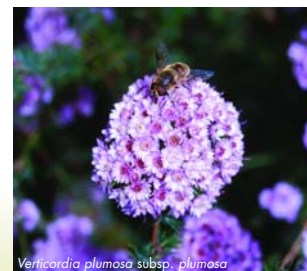
Verticordia plumosa subsp. plumosa