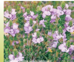
Euphorbia collina subsp. tetragona