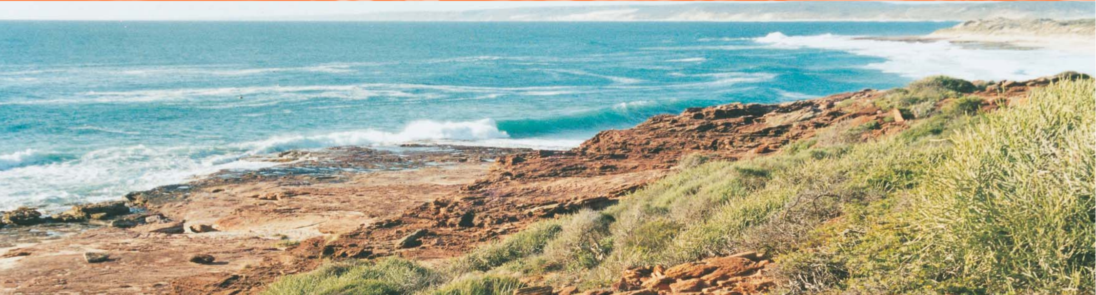
Goat Gulch, Kalbarri National Park