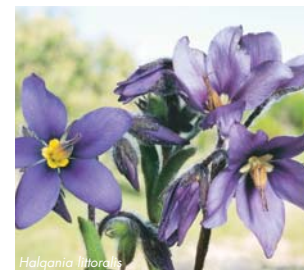
Red Bluff, Kalbarri National Park