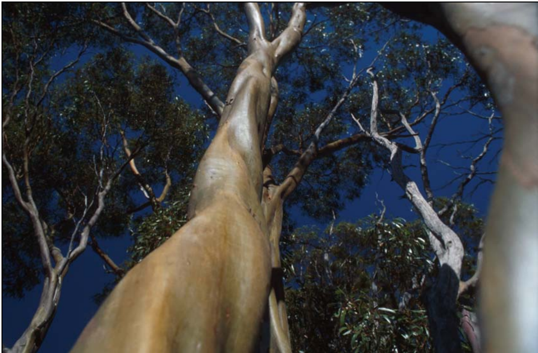
Woodland Watch site 12

Woodland Watch has already provided the WA Herbarium with several likely new species and an invaluable window onto the diversity within four of our major Wheatbelt woodlands.