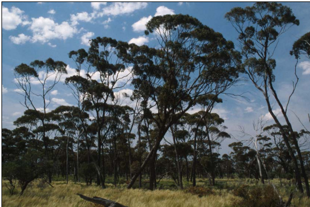
Woodland Watch site 4

The Acacia specimens collected during the first two years of Woodland Watch have also assisted in the refinement of taxonomic data for the electronic key to this genus (Maslin, 2001).