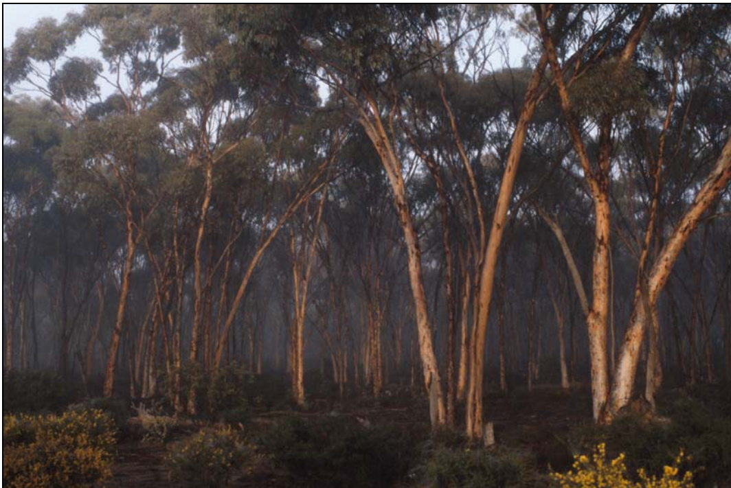
A magnificent Wheatbelt woodland

Proteaceae was also poorly represented in these woodland types. Four species from this family were common. Three, Hakea recurva , H. preissii and Grevillea paniculata were commonly found in association in Eucalyptus loxophleba woodlands. Grevillea huegelii was commonly found in Eucalyptus salmonophloia woodlands.